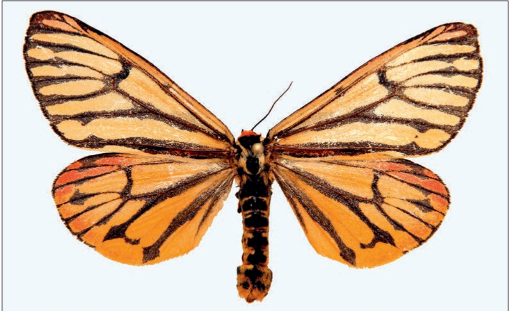
Fig. 1. Borearctia menetriesii specimen (female) from the Sotka River valley, Arkhangelsk Oblast, Northern European Russia (photo by Yu. Kolosova).

lage). Two localities were digitised from the general range map by Dubatolov (2010) and the obtained coordinates are highly approximated, probably by around \pm 5 km. We used Bailey's Ecoregions Map of the Continents (Bailey 1989) for generalised estimation of the species preferences for ecosystem types. On this map, ecosystem units of regional extent (ecoregions) are marked by climate and vegetation. An Arcview shapefile containing ecoregions map data was obtained from the Global Ecosystem Data Base of NOAA's National Geophysical Data Center, Boulder, Colorado, USA.