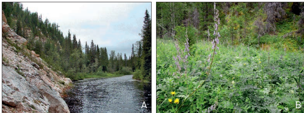
Fig. 2. Habitat of Borearctia menetriesii . A , the Sotka River valley with karst gypsum outcrop, Pinega region, Arkhangelsk Oblast, Northern European Russia. B , forest humid mixed-herb meadow where specimen was collected.